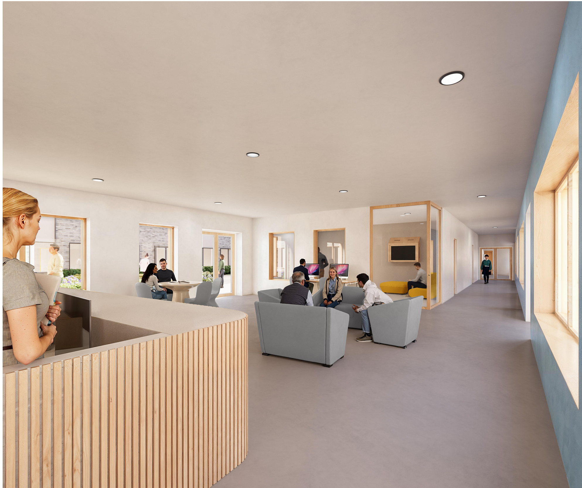
200-bed Adult In-Patient Hospital On Ward Daily Living Space

COPYRIGHT: The design and details shown on this drawing are applicable to The Named Project only and may not be; reproduced, modified or relayed in whole or part or be used for any other project or purpose without the prior written permission of TOT Architects with whom copyright resides. DO NOT SCALE this drawing. Use figured dimensions only. The Contractor is responsible for checking all levels and dimensions on site prior to commencement of works. Any discrepancies are to be referred to the ARCHITECT. Drawings to be read in conjunction with all other Consultants Drawings & Specifications were relevant. Proprietary items shall be fixed in strict accordance with the Manufacturer's Instructions. Sizes of proprietary items shall be checked with Manufacturer.